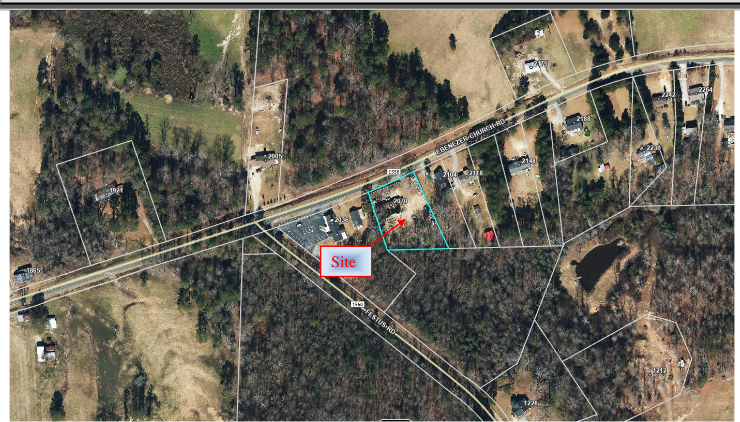
Directions from Lillington: Travel US 401 South toward Campbell College – Turn left onto Leslie Campbell Ave. – Continue onto NC 27 East – Left onto Ebenezer Church Road - Property is located on the right just after passing Festus Road.