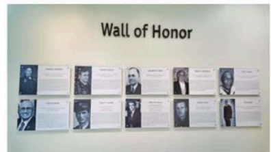
Harnett Life - Spring 2024